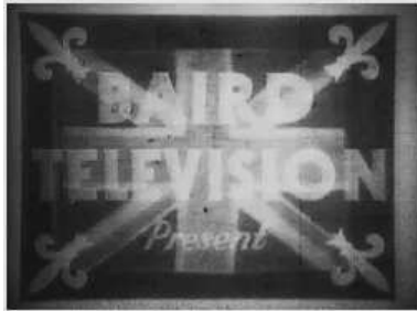
Baird Television logo.

On 2 October, 2025, it will be one hundred years since John Logie Baird obtained the world's first true television images. The first public demonstration on 26 January 2026. Whether you're in media, journalism, tech, advertising, science, politics, computing, or streaming it's time to ask what debt your industry has to Baird's innovation and how you might mark the Centenary.