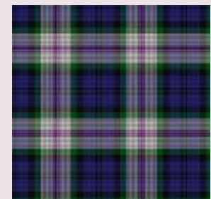
BAIRD DRESS/DANCE opt. 1