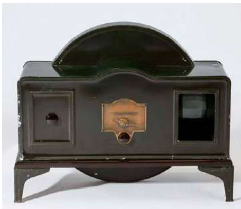
Baird 'Tin Box' television with its tiny screen on the right. About one thousand were sold to wealthy customers who would be able to watch Baird/BBC broadcasts between 1929 and 1935.