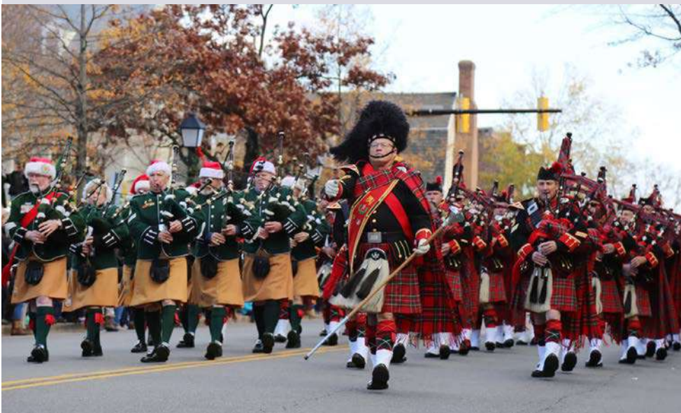
Massed Bands at the Alexandria Virginia Scottish Christmas Walk Parade